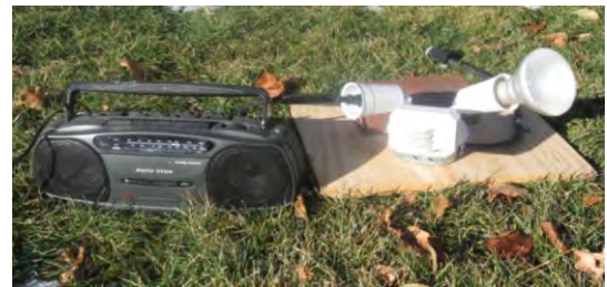
Jack's Deterrent Device